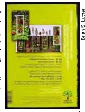
cont. on page 6

Scott 2461 is the souvenir sheet (s/s): it shows a continuous scene of the two stamps together. The Douglas Fir stamp (2462) towers above; below it is the Amanita muscaria stamp (2463). The actual Amanita stamp shows three basidiocarps; two more mushrooms of the same species are shown next to these in the overall illustration but