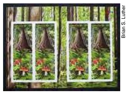
Inside of booklet Scott 2463a with eight stamps.