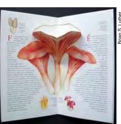
Inside of presentation pack for Scott 1245-48 with pop-up Cantharellus cinnabarinus.

Canada Post also issued Images No. 1 , a book describing in greater detail all of the stamps issued in 1989. The cover has a beautiful illustration of Leratiomyces squamosus var. thraustus