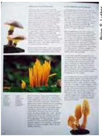
with a mycologist on the ID here. tion of the Postage Stamps of Canada 1989 book.

In addition, a 42 page book was issued by Canada Post titled Souvenir Collection of the Postage Stamps of Canada 1989 with all the stamps in it and a lot more text and illustrations relating to the issues from that year. Page 18, titled "Mushrooms: Fascinating Fungi," has photographs of some of the fungi that are on the set of stamps. Unfortunately the photograph of the bolete shows two basidiocarps of Suillus luteus (Slippery Jacks), not Boletus mirabilis—oops! It's clear that they failed to consult Page 18 from Souvenir Collec-