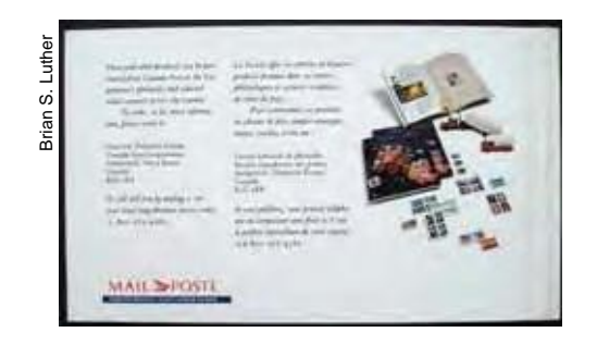
Back of booklet for Scott 1272 & 1273 (see text).

The next item from Canada Post showing fungi is a booklet titled "Moving the Mail. The Story of Canada's Postal System." Only the back cover of the booklet shows fungi, a small picture of the "Souvenir Collection of the Postage Stamps of Canada 1989" (mentioned in the previous paragraphs). The left-hand page shows the four-value mushroom section, with separate mushroom illustrations and text; the right-hand page shows the four value set by itself, as well as the same set shown separately below. Because this single booklet contains two different stamps, the Scott Catalogue has given it two numbers (see table) although the stamps themselves do not show any fungi.