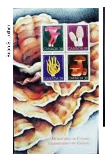
Cover of presentation pack for Scott 1245–48, with Trametes versicolor.

In the presentation pack issued for this set, the four stamps are mounted in a clear sleeve, with the entire cover featuring Trametes versicolor on both the front and the back. Although this polypore is the main illustration on the presentation pack, it is not on any of the stamps in the set. When you open the presentation pack, titled "Mushrooms of Canada," a cute illustration of Cantharellus cinnabarinus pops up, like you'd find in a children's book. Two different FDCs were issued for this set as well. The first has all four stamps on a single envelope (cover); the cachet shows a morel and the bolete along with microstructures of each; the cancel shows a Death Cup Amanita with three maturing basidiocarps as seen in longitudinal section (egg button stage, half grown, and mature). The other FDCs show each of the four individual stamps on separate envelopes, with the same cachet and cancel just mentioned. Also, the back side of the FDC tells all about each of the four mushrooms in the set.