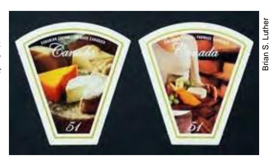
Scott 2170 & 2171 showing moldy cheeses (see text).

The third postal item with fungi is the right front outside cover of Canada booklet 2171a, which shows a round of cheese covered with mold, on which is a smaller wedge of yellow cheddar. The mold growth is obvious and is most likely Penicillium roqueforti or Penicillium camemberti , the two common species growing on and flavoring cheeses. The variety of cheese is not specifically mentioned, however, so we don't know for sure. The two stamps (2170 & 2171) are photographs designed and shaped to appear like cheese labels. All these stamps are die cut and self-stick.