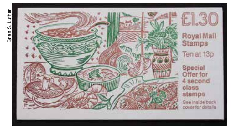
Cover of booklet BK532.

Scott BK532 booklet cover shows a scene of food in a kitchen, with five stylized edible mushrooms on it. This booklet is titled "Recipe Cards" in the catalogs, and the stamps inside have no fungal illustrations—the mushrooms are only on the booklet cover.