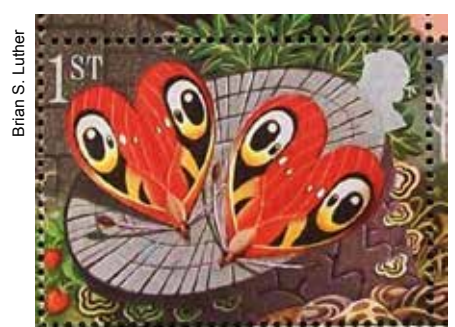
Scott 1358, with Trametes versicolor

Scott 1358 shows a stump with two Peacock Butterflies and a stylized fungus with zonate pilei growing all around it. According to the 2011 Scott Catalogue the insects are "Peacock Moths," which is