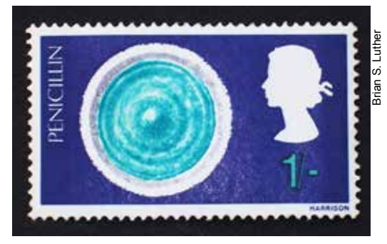
Great Britain Scott 519. This is the first stamp to commemorate penicillin, in 1967.

Four of the stamps listed in different sets in the table below show Penicillium spp. on them. Scott 519 shows a Petri plate culture of the fungus used to extract the antibiotic from and is the very first postage stamp ever issued commemorating penicillin, in the year 1967. It is also the first British stamp with a fungus as the main