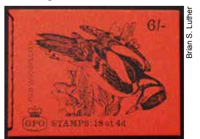
Booklet cover, BK115.

The cover of booklet BK115 shows a Pied Woodpecker, but has a polypore conk beside it growing on the tree, which is stylized and not identifiable to species.