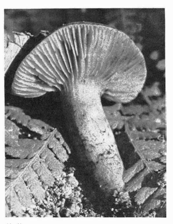
Phylloporus rhodoxanthus – the only gilled Bolete see Smith, p. 71

Any assignment will involve only a few hours of your time in cooperation with other interesting people. Remember, you don't have to be a mushroom specialist, you just come to have fun in helping to make your show a success.