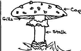
'Fly Agaric' - Amanita muscaria Poisonous Cap: red with white warts Gills + stalk: white