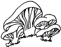
'Oyster Mushroom' - Pleurotus ostreatus Edible Cap: yellow-brown Gills: white Stalk: white