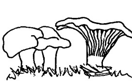
'Chanterelle' - Cantharellus cibarius Edible Cap: soft egg-yolk yellow Gills + stalk: same as cap