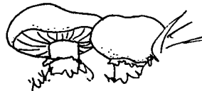
'Meadow Mushroom' - Agericus campestris Edible Cap: white Gills: brown Stalk: white