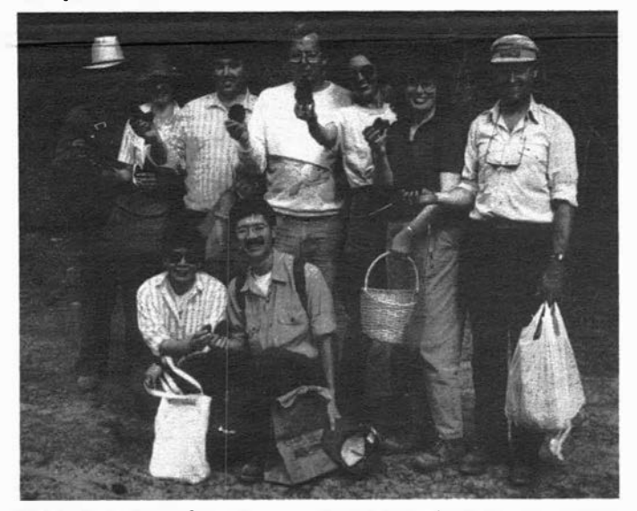
Happy hunters at 29 Pines. For some new members it was their first experience stalking the wild morel.

Forty-eight stayed to enjoy a delicious potluck on a beautiful day. On behalf of the hosts, we thank the weather gods for our good weather, the members for the good company, and those who stayed in camp during the day and helped us keep the fire going and the coffee pots full.