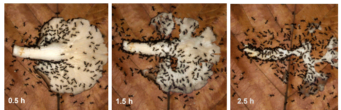
Euprenolepis procera at work.