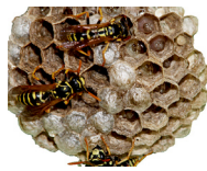
Yellow jacket nest.

Coordination Centre received a call from the ambulance service asking for their aircraft, as rescuers believed air crews could get to the man faster than personnel on foot. The rescue center sent out a Cormorant helicopter and Buffalo fixed-wing plane. Search-and-rescue crews in the Buffalo were guided to the site on the mountain by hikers at the scene who had cell phones, said Capt. Aaron Twa.