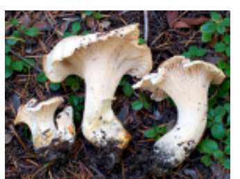
Some White Chanterelles (Cantharellus subalbidus) found at Soda Springs.

Most everybody found at least a few White Chanterelles ( Can tharellus subalbidus ) with diligent searching, and some were lucky enough to get Boletus edu lis . Several non-PSMS families camping there were interested in our endeavor, and promptly went out looking for mushrooms to get identified. One family went across the bridge to a place all of us had been by numerous times and to