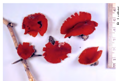
Sarcoscypha coccinea from eastern WA.

At the spring foray at Tall Timbers (NE of Lake Wenatchee) in May of 2000, one collection was found. The collection had rather open to flattened cups at maturity with only a slight or indistinct stipe. As a result, we were not sure of its ID. I took careful fresh notes on the collec-