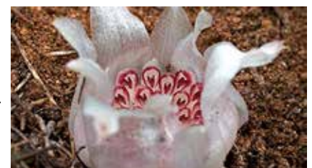
Rhizanthella gardneri .

"To find the underground orchid, even where we know it is, we wait until it's flowering (late May or early June) and then go crawling underneath the broom thicket and lift the leaf litter up and see the flowers under there," she said.