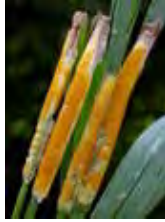
Epichloë sp. on red fescue.

That means that over the eons red fescue and the fungus, called Epichloë festucae , have developed a I'll-scratch-your-back-if-you-scratch-mine relationship. Red fescue provides a home for the fungus, which in return bumps off hungry herbivores that would devour its host.