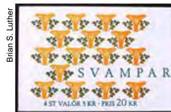
Scott 2190a booklet cover

Booklet cover 2190a has 16 stylized chanterelles on it. Of the five stamps in the set, 2186 is not attached to the other four comprising the booklet pane; rather it is loose; it is imperf. on two sides (left & right). Stamps 2187 & 2188 are imperf. on the top only, and 2189 & 2190 are imperf. on the bottom only. All the stamps in this set have gum. The back of the FDC for this set briefly describes the five species shown. It explains that the Swedish common name for Boletus edulis is Karljohan, because according to Fries it was a favorite of King Karl XIV of Sweden. It also calls Coprinus comatus “The ink cap” (what we call the Shaggy Mane). The Inky Cap to us is an entirely different species ( Coprinopsis atramentarius ), but that’s how ambiguous common names can be and the reason why we must rely on scientific names.