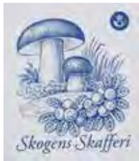
Scott 2491a–2491d, bkl cover

The 2004 Forest Larder set (2491a–d) is super cute and colorful, with the four stamps showing both edible wild mushrooms and/or edible wild berries found in Sweden. All stamps are serpentine die cut on three sides only and are self-stick. None of the mushrooms (or fruits) are labeled, but I've provided scientific names for them in the table. Two of the four stamps show mushrooms: stamp 2491a shows only Chlorophyllum procera , but 2491c shows Bolletus edulis , a Russula sp. and Cantharellus cibarius (Chanterelle) growing, along with a basket full of mixed B. edulis , Russula sp. , Lactarius deliciosus , and a Chanterelle. Stamps 2491b & 2491d show woodland scenes with berries, but no mushrooms. The value is not shown on these stamps, but all are 5.5 kr. The Scott Catalogue lists the booklet pane of four stamps by itself as 2491e.