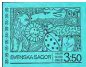
Scott 841a booklet cover

Only the booklet cover 841a shows a fungus—a stylized mushroom with an owl sitting on top, along with a moose, a bear, a sunflower, and a ladybug. The stamps within the booklet do not illustrate any fungi.