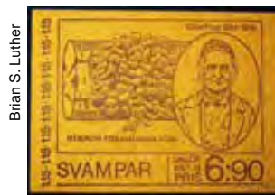
Scott 1264a booklet cover

Booklet cover 1264a shows Elias Magnus Fries along with Hericium (Hydnum) coralloides . Fries (pronounced “freeze”) is considered the father of mushroom taxonomy. He devised the spore print color system (Friesian system) along with hymenophore configuration for mushroom taxonomy. Fries was Professor of Botany at Uppsala University, Sweden. All of his observations were either macroscopic or as viewed under a hand lens; he did not use a microscope. He wrote Systema Mycologicum in 1821–32 (3 vols.) and other important early works. The ICBN (International Code of Botanical Nomenclature) used these publications as the starting point for fungal names (along with Christiania Hendrik Persoon’s Synopsis Methodica Fungorum , 1801, for rusts, smuts, and Gasteromycetes). Then they decided to use Linnaeus’ Species Plantarum (1753) as the starting point instead. These changes were implemented in 1982 with the Sydney Code. The booklet panes* for 1259–61 are imperf. on the top, and those for 1262–64 are imperf. on the bottom. All stamps have gum.