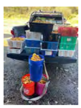
179 pounds of mushrooms seized by Washington State Dept. of Fish & Wildlife.

WDFW says it is illegal to harvest over five gallons of wild edible mushrooms without a specialized forest products permit. Landowner permission is required to possess smaller quantities from private property.