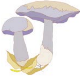
Lepista nuda , the Blewit

Blue foot mushrooms, named for the tender blue to violet tint on their stems and the tops of their beige caps, grow abundantly in North America and Europe from late summer through fall, when foragers search for them. But now cultivated blue foots from France and the Netherlands are being sold in the United States. The mushrooms, also called blewits, are not shy, tasting of earth and spice, and they never go limp in the pan. Sauté them in butter, dusting with curry powder as they cook, and finish the dish with a little heavy cream. The mushrooms keep their color better if they are simmered in vegetable stock for 10 minutes, then used in a soup or cooled and tossed in a salad. They are $24 a pound at Dean & DeLuca, $23 at Agata & Valentina, and $32.50 at the Manhattan Fruit Exchange.