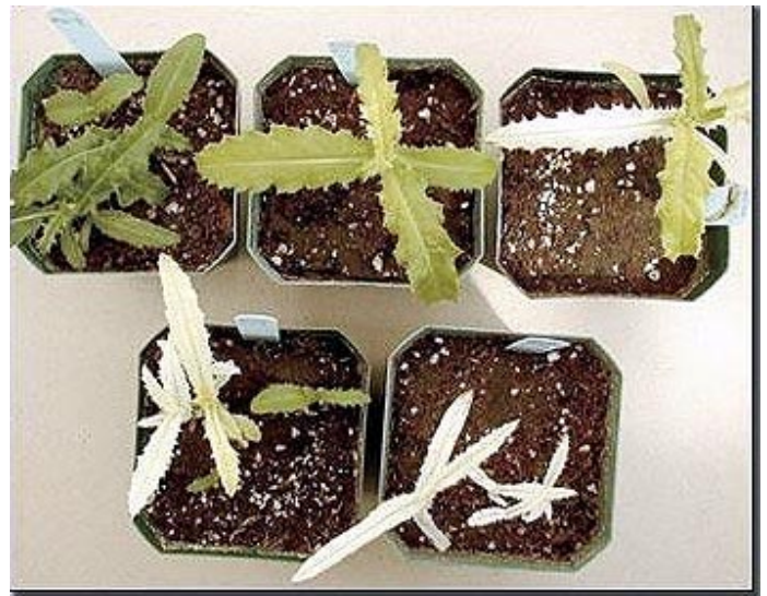
Canada Thistle plants turn white and eventually die as the amount of Phoma macrostoma applied to the soil increases and inhibits the plant’s ability to manufacture chlorophyll.

Bailey said it could be 2–8 years before the fungus will be available. However, she adds researchers are closer to working with government regulators to develop guidelines to ensure product safety.