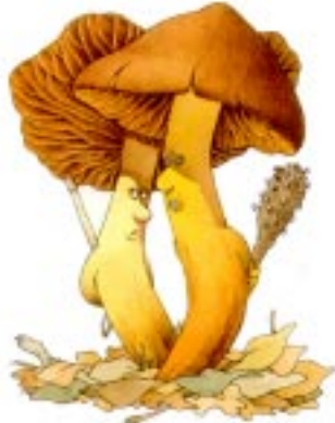
(from Le Gratin des Champignons , Sabatier & Becker)

A quiet stroll in the woods can be the perfect antidote to a noisy, fume-filled, jostling urban jungle. But while on the surface everything may appear calm and tranquil, beneath the feet, in the rotting leaves and in the dead branches, silent battles are being fought with a terrible ferocity. This is the dark, mysterious, and surprisingly violent world of fungi. These organisms spend their lives searching for new sources of food, and when two fungi come across the same piece of dead wood or pile of leaves, a battle for supremacy can ensue.