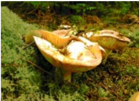
Russula crassotunicata in the spring

Like some kind of myco-zombie, this beast turns brown, rots, molds, and stinks to high heaven over a period of months. But it just never seems to go away. This persistence may be a key reason that this mushroom is an important host for some of our other fascinating