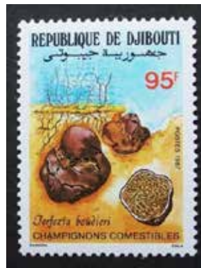
Djibouti, Scott 627. Terfezia boudieri .