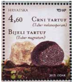
Croatia (2013). Tuber melanosporum & T. magnatum .