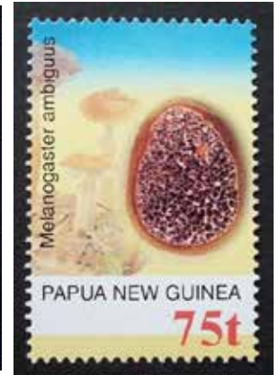
Papua New Guinea, Scott 1177. Melanogaster ambiguus .