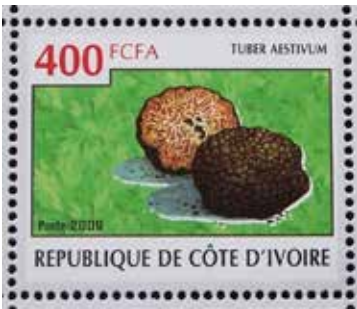
Ivory Coast (2009). Close up of truffle stamp.