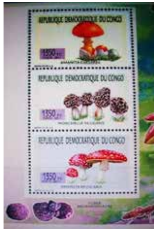
Congo Rep. (2011), s/s with Tuber melanosporum in lower margin.