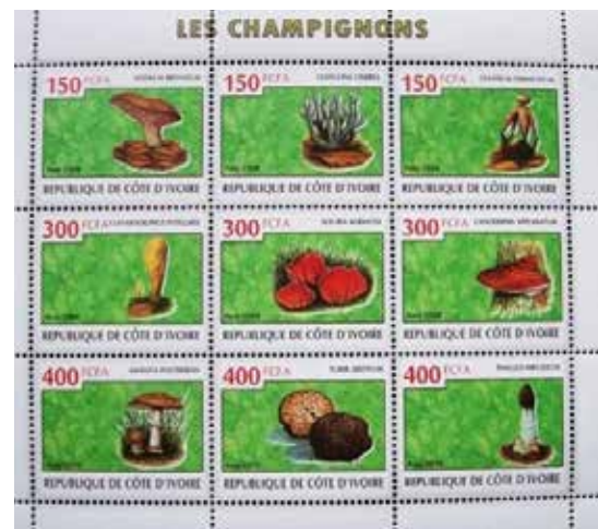
Ivory Coast (2009), full sheet.