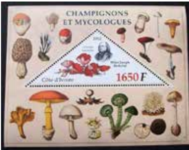
Ivory Coast (2012). Stamp souvenir sheet with truffle cut in half in lower right-hand corner of margin.