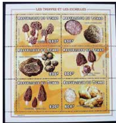
Chad, (1998) sheet, Les Truffles et Les Morilles .