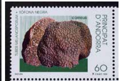
Andorra, Scott 238. Tuber melanosporum .