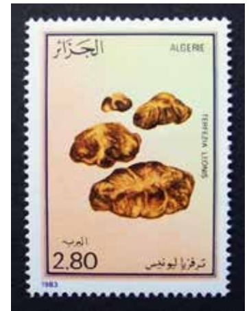
Algeria, Scott 719, Terfezia leonis .