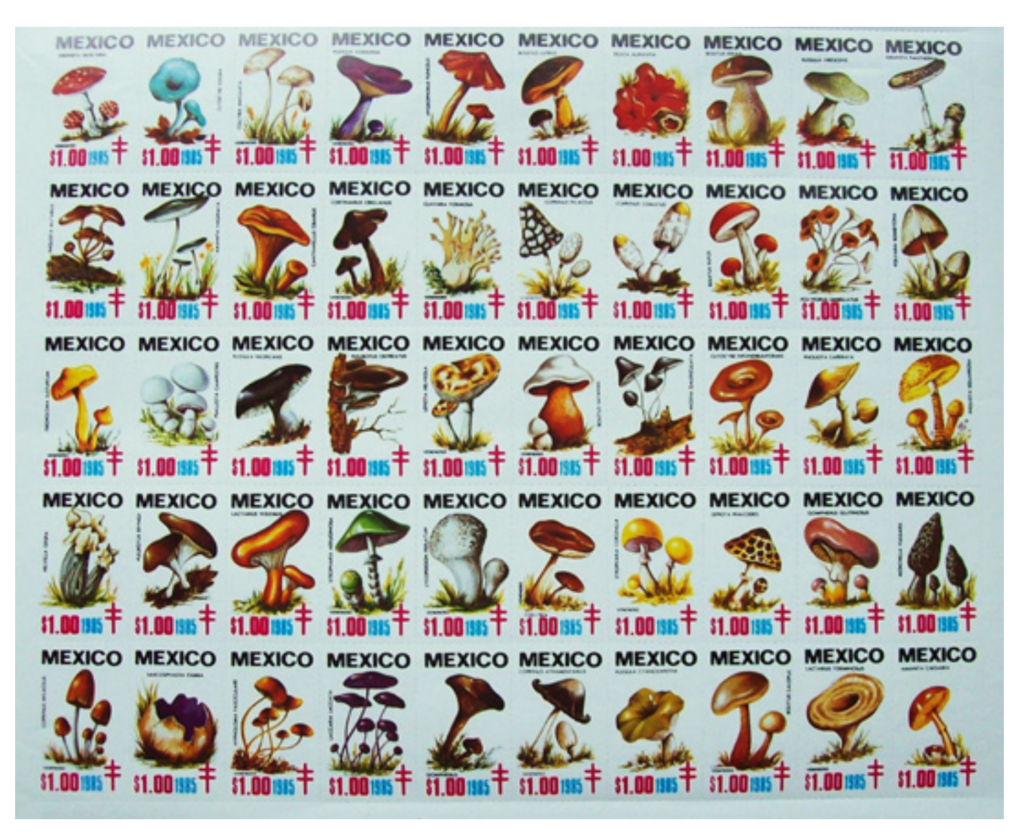
Mexico - TB seals (non-postage). Sheet of 50 different mushrooms.