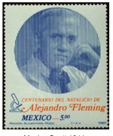
Mexico Scott 1241.