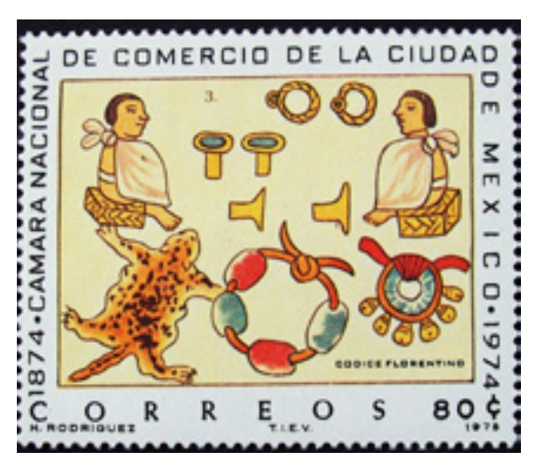
Mexico Scott 1085. Stylized mushrooms are shown, presumably used in rituals.

For those of you interested in the macrofungi of Mexico, I can recommend the following older field guides: Guzman (1978, 1979), Tablada (1983).