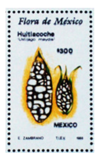
Mexico Scott 1577 - Corn Smut (Ustilago maydis).